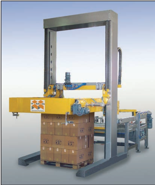
Semiautomatic model, for pallet change an operator is required.

Low-level automatic or semiautomatic palletiser with the pallet in a stationery position for low production needs. Ideal for cartons, crates, jerry cans and shrink-packed products. The products on infeed are distanced one from the other, orientated, grouped into layers and placed on the pallet in a pre-determined programme.