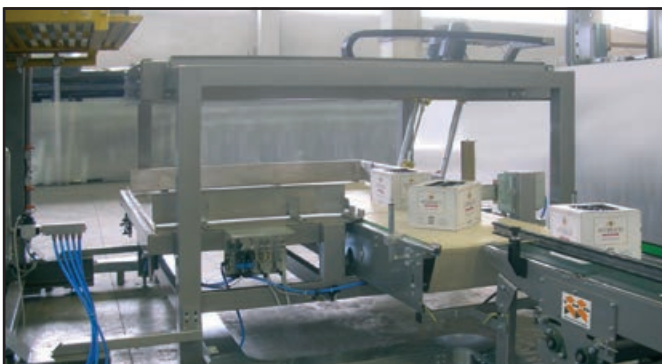
Acetalic flex chain for layer preformer and lifting device pusher.

In alternative to palletising with the pallet on the ground or directly on the pallet outfeed conveyor, the palletiser can be fitted with a shuttle car system in the layer unloading area with two or more stations to allow different products to be palletised simultaneously on separate pallets.